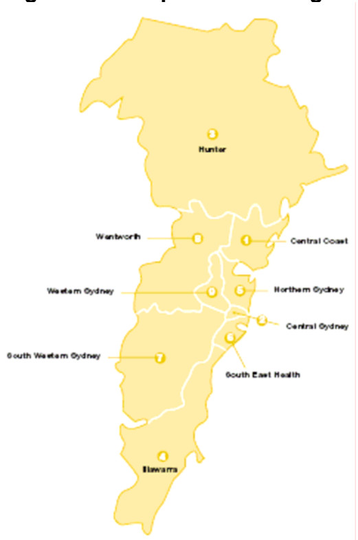
Figure 2: Metropolitan and Regional Area Health Services pre-2005 Reforms

Sourced from NSW Health Annual Report, 2003-04.